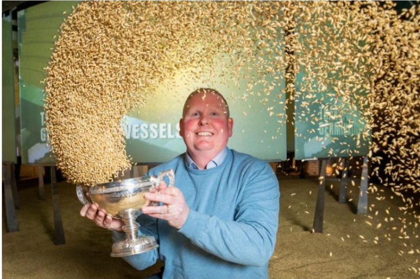
Laois farmer wins the Guinness Perpetual Cup for Malting Barley Excellence.